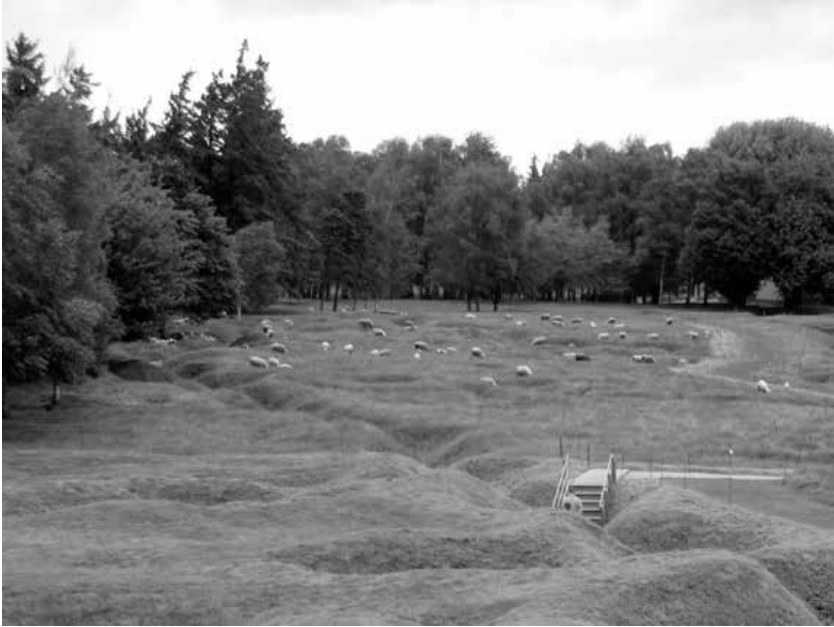
FIG. 6. Preserved battlefield and trenches from the Battle of the Somme in the Newfoundland Memorial Park, Beaumont-Hamel, Northern France.

The pervasiveness and ubiquity of death were overwhelming. Isaac Rosenberg describes the Front as “Dead Man’s Dump,” with “wheels lurch[ing] over the sprawled dead.” 26 Wilfred Owen writes to his mother of “the distortion of the dead” and of their “unburiable bodies.” 27 No Man’s Land, the space between the opposing trenches, was dotted with