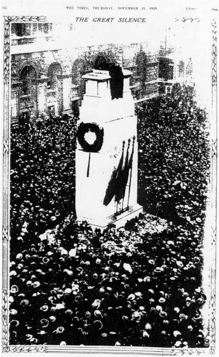
FIG. 8. The Cenotaph, or empty tomb, in London. Over one million mourners flooded past the Cenotaph when the Unknown Warrior was buried at Westminster Abbey.